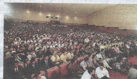
Chowdaiah Memorial Hall was packed with school students, who came to take part in the TCS IT Wiz quiz programme on Thursday

The widely celebrated Edinburgh International Science Festival will be on from August 30 to September 8 at Bhartiya City