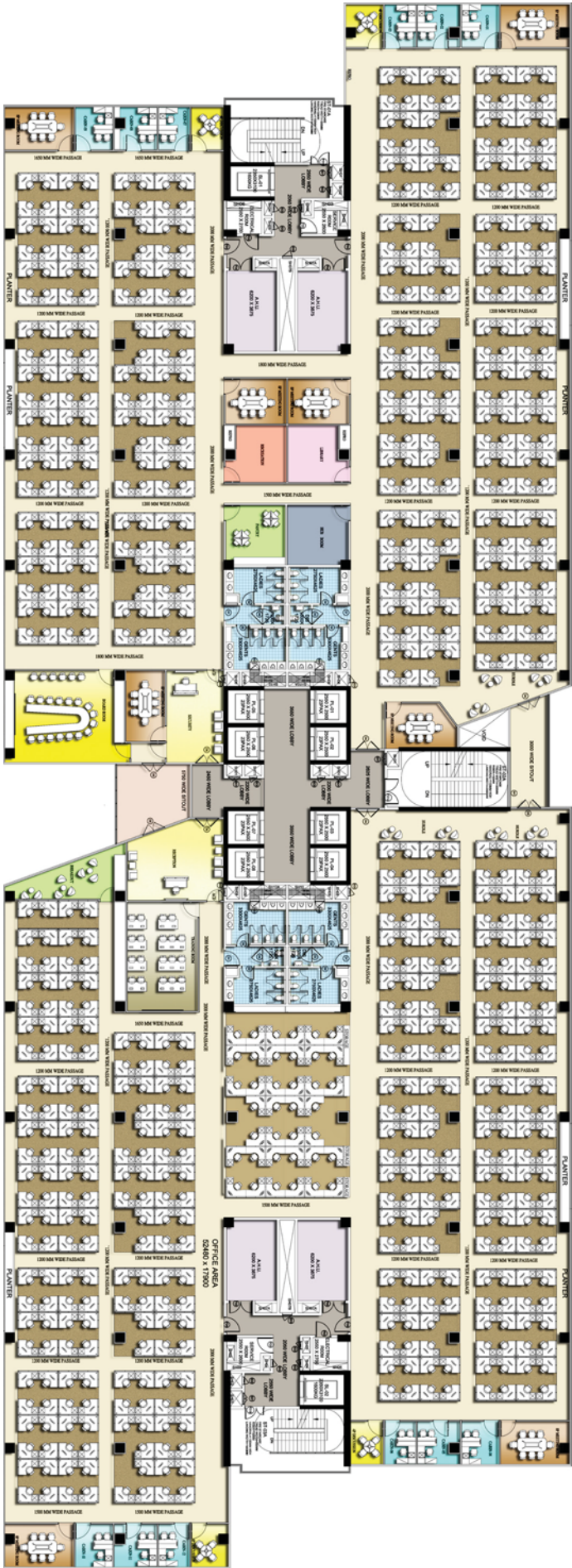
Test Fit for 2 nd , 4 th , 6 th & 8 th Floor